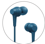
SE-C1T (L) Deep Blue