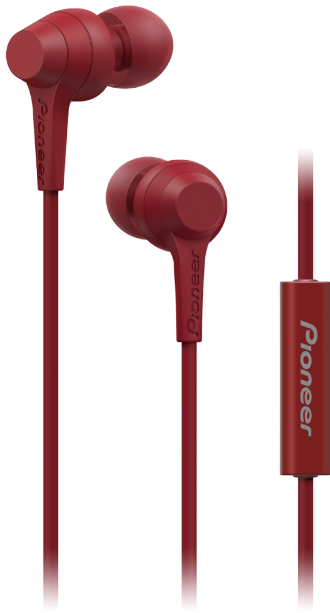
SE-C1T (R) Bordeaux Red

Bordeaux Red Powder Pink Mint Green Deep Blue All White Charcoal Black