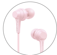
SE-C1T (P) Powder Pink

Play your music free and clear with the Pioneer C1s. These compact earphones are made for fun sound on the go. Large dynamic drivers love bass and have a clean mid-range for vocals. Drivers and nozzles are specially angled to send sound directly into your inner ears. This structure also helps the C1s stay in place, and for the earphone tips to insulate against noise. You'll be surprised how great they sound, and also at their high-value features. The thick, durable, tangle-resistant cable has a remote button to make, take, and end calls; there are six matching color schemes to choose from; and the earphones come with three sets of earphone tips for a comfortable fit.