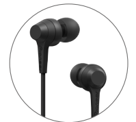
SE-C1T (B) Charcoal Black