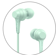
SE-C1T (GR) Mint Green