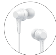
SE-C1T (W) All White